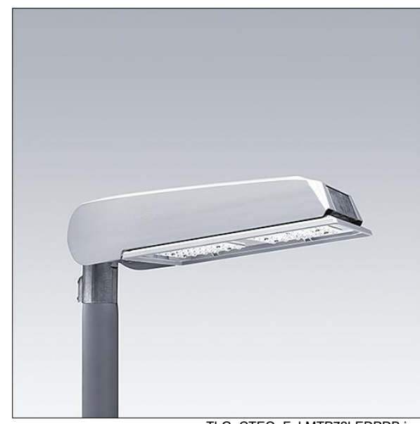
TLG CTEQ F LMTP72LEDPDB.jpg

Weight: 9.35 kg Scx: 0.115 m<sup>2</sup>