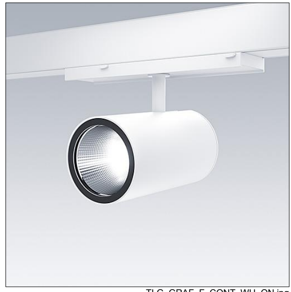
TLG GRAF F CONT WH ON.jpg