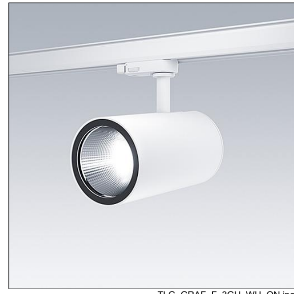
TLG GRAF F 3GU WH ON.jpg