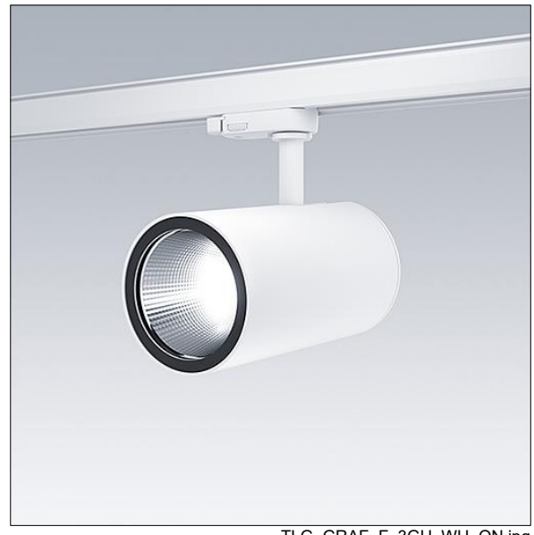
TLG GRAF F 3GU WH ON.jpg