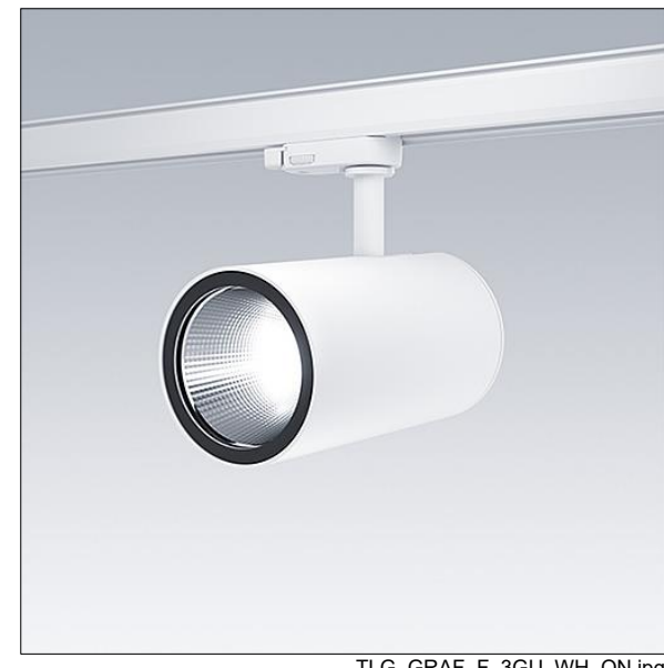
TLG GRAF F 3GU WH ON.jpg