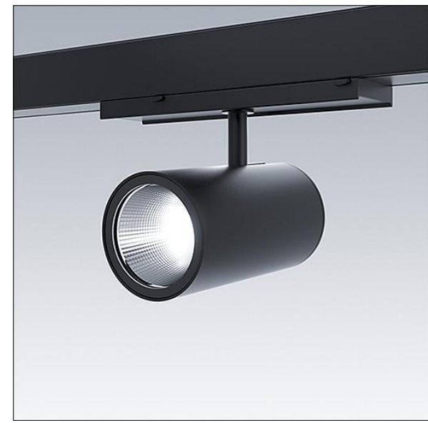
TLG GRAF F CONT BK ON.jpg