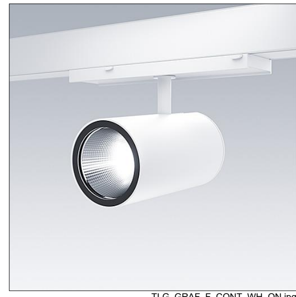
TLG GRAF F CONT WH ON.jpg