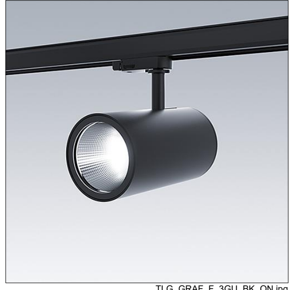
TLG GRAF F 3GU BK ON.jpg