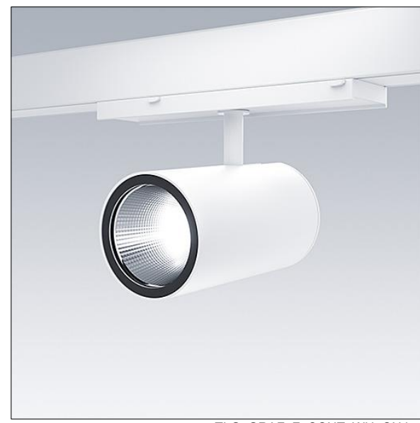
TLG GRAF F CONT WH ON.jpg