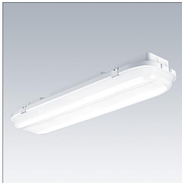
TLG FORL F PDBUNLIT.jpg

Dimensions: 735 x 180 x 95 mm Luminaire input power: 50.1 W Luminaire luminous flux: 7000 lm Luminaire efficacy: 140 lm/W Weight: 3.1 kg