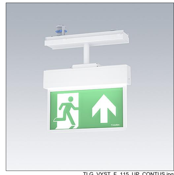
TLG VYST F 115 UP CONTUS.jpg