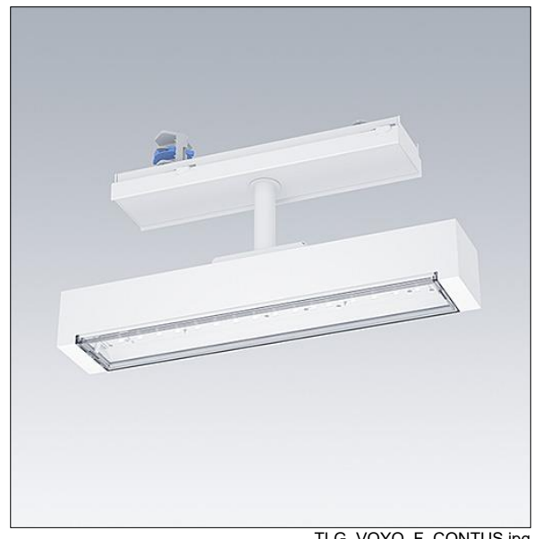
TLG VOYO F CONTUS.jpg