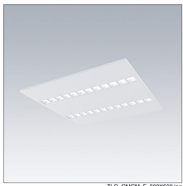
TLG OMGM F 600X600.jpg