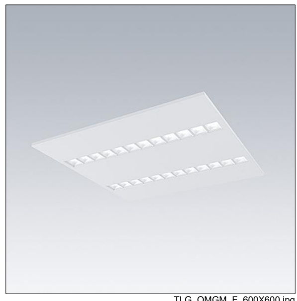
TLG OMGM F 600X600.jpg