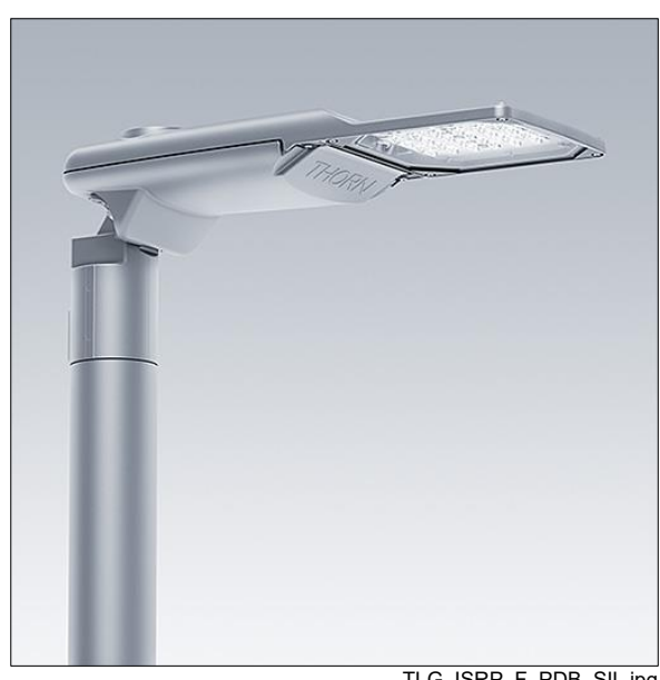
TLG ISRP F PDB SIL.jpg