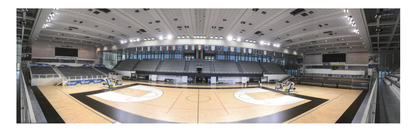
Image 2: A total of 92 symmetrical and asymmetrical floodlights can achieve lighting levels of up to 3400 lux