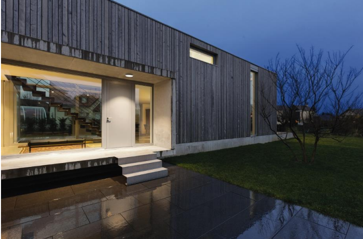
Image2: Katona is ideal for both, indoor and outdoor applications, as it's rated IK10