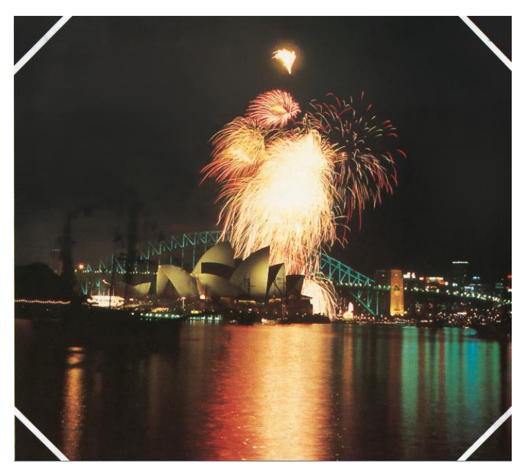
1988 – Opening of the Sydney Opera House under Thorn floodlights