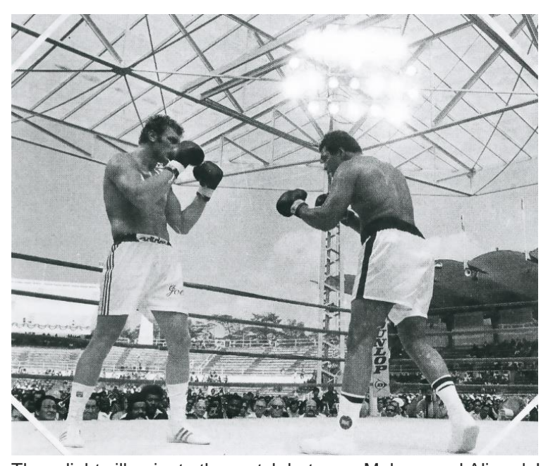
Thorn lights illuminate the match between Muhammad Ali and Joe Bugner in Kuala Lumpur, 1975