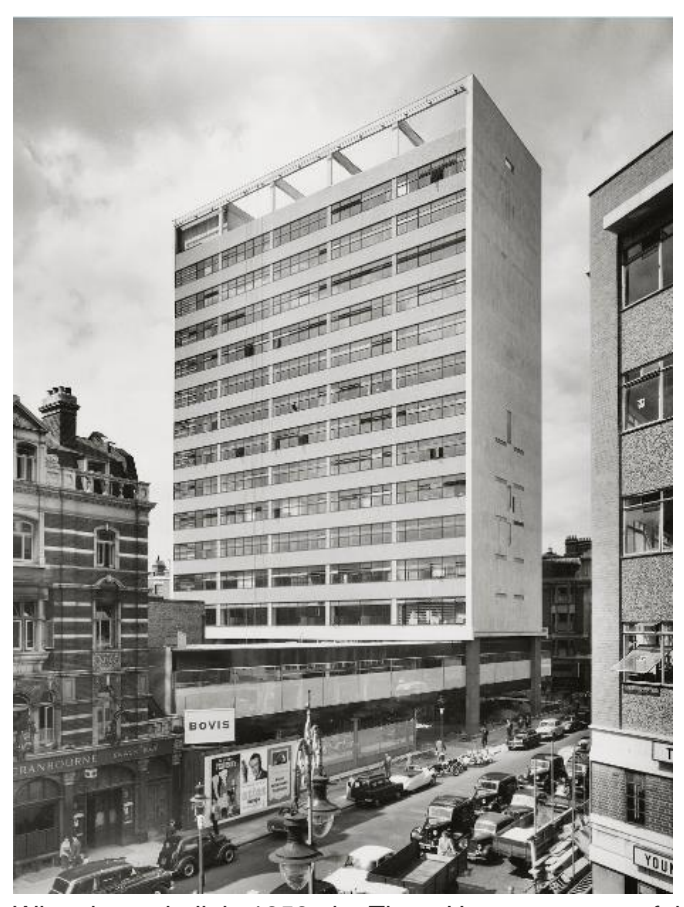
When it was built in 1959, the Thorn House was one of the tallest buildings on the London skyline