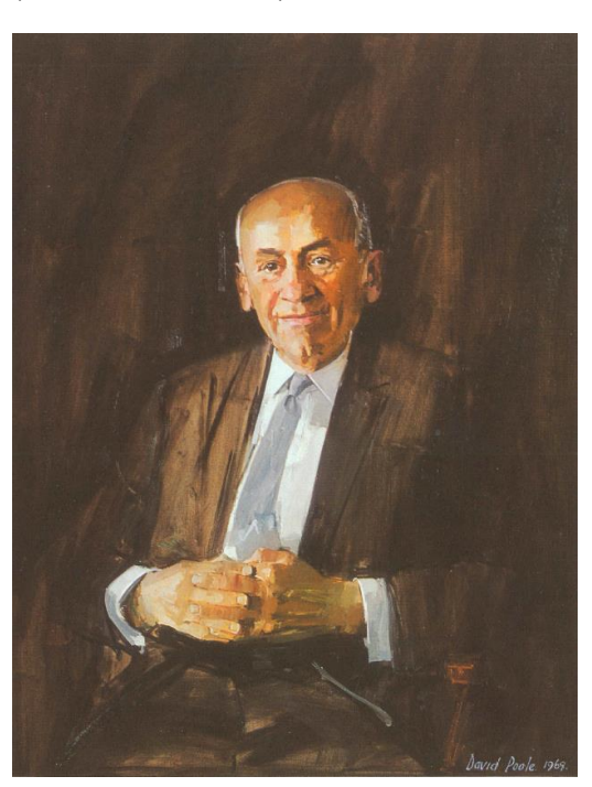
Jules Thorn, 1899 – 1981. Oil painting by David Poole, 1969