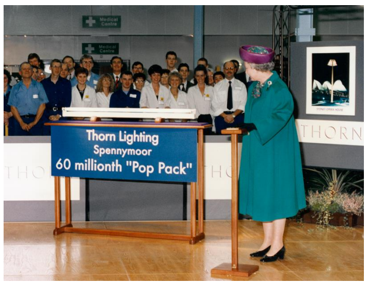
Queen Elizabeth II visits Thorn's Spennymoor factory to see the production of the 60 millionth PopPack luminaire, 1995