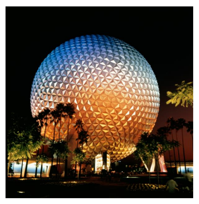
The 49 m diamtere globe named "Spaceship Earth" which is the symbol of EPCOT Centre in Florida, was floodlit by Thorn CSI lamps in 1983