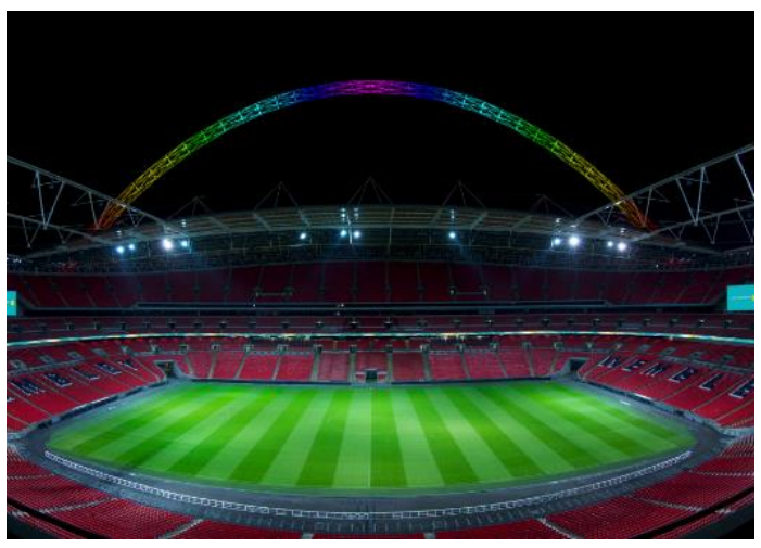
Thorn replaced the stadium's iconic arch lighting with a custom LED lighting system designed for full colour as well as special moving light effects.