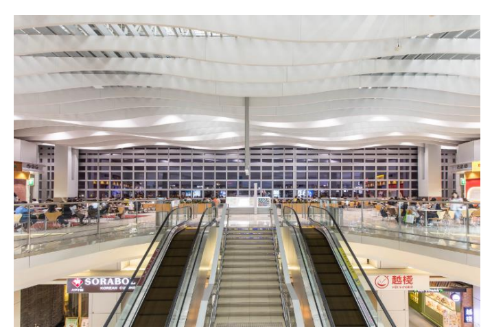
Thorn lights at Hong Kong International Airport Terminal 2