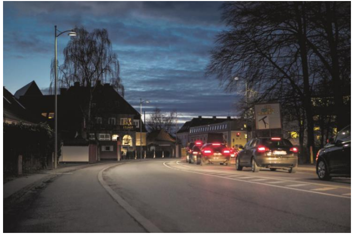
A truly connected solution for smart, energy efficient lighting in Copenhagen delivered by Thorn Lighting