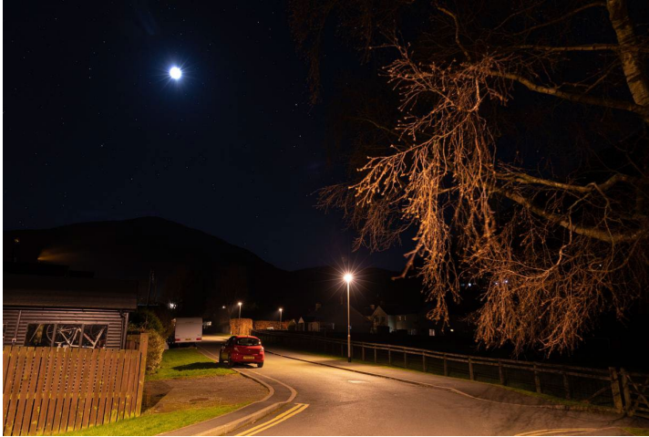
Barraclough Fold, Glenridding