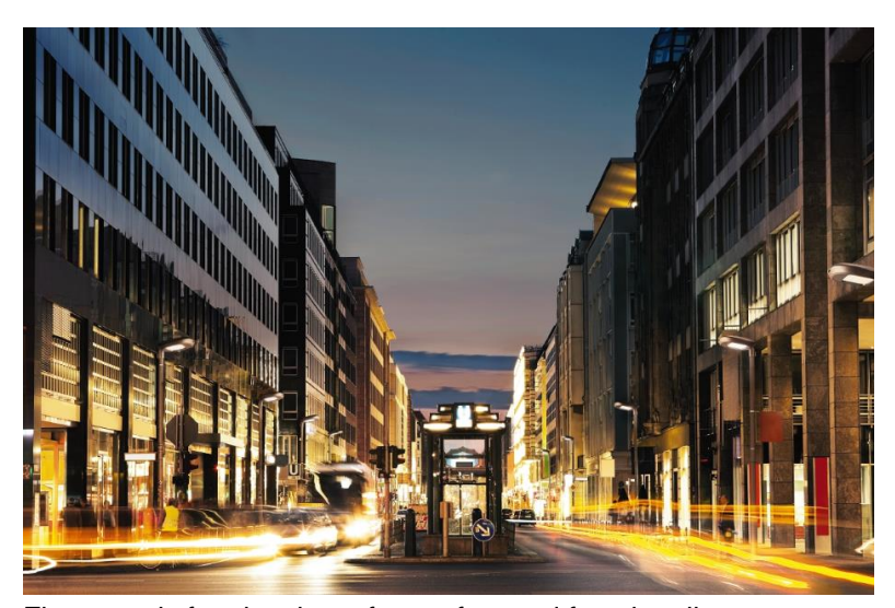
Flow stands for visual comfort, safety and functionality