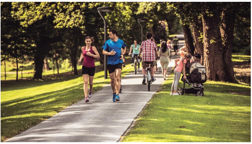
The timeless, understated design language of this brand new luminaire makes it easy to picture in any setting